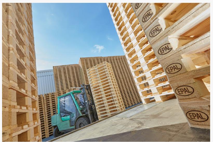
Pallet Control Tower provides an online digital platform for acquisition, trading and management of EU-grade pallets

This regulatory initiative articulates a comprehensive framework for EU businesses intended to eliminate packaging waste and promote accelerated recycling and reuse of packaging materials, including pallets. It will subject manufacturers, distributors, e-commerce retailers, fulfillment operators, packaging producers, transportation firms and other supply chain participants to a wide range of regulations, with reuse targets designed to eliminate waste and create a “circular supply chain.”