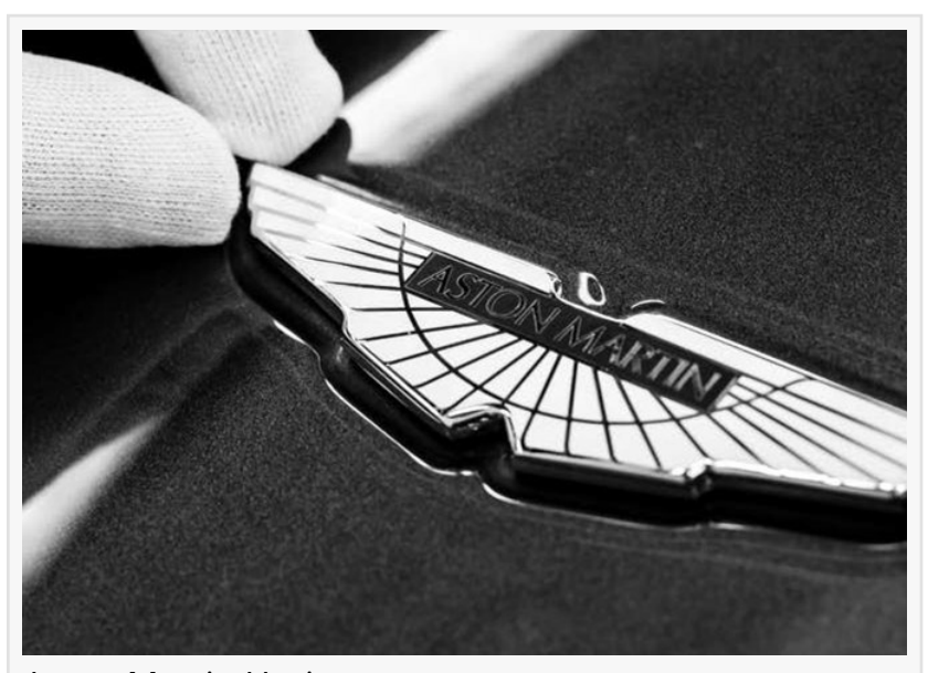
Aston Martin Heritage

Miami's real estate market has seen a significant increase in sales of properties priced at $10 million and above. With global investors viewing Miami as a top-tier destination for luxury living, the city's real estate sector has evolved into a hub for ultrawealthy buyers. Prime neighborhoods such as Fisher Island, Star Island, Palm Island, and the ultra-luxury developments along Brickell, Sunny