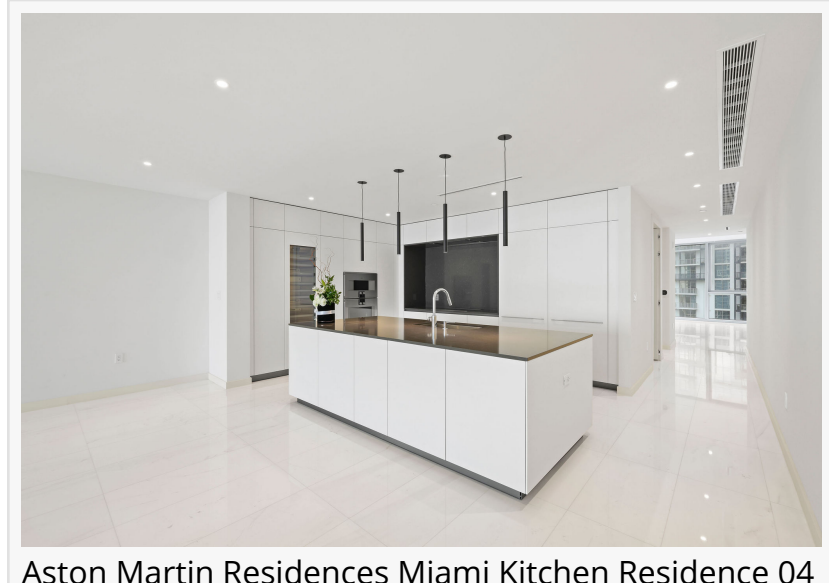
Aston Martin Residences Miami Kitchen Residence 04 Center Tower

Branded residences have emerged as one of the hottest trends in Miami's real estate market. Projects from Aston Martin, Bentley, Porsche Design, and St. Regis are reshaping the skyline, offering buyers exclusivity, top-tier amenities, and unparalleled services.