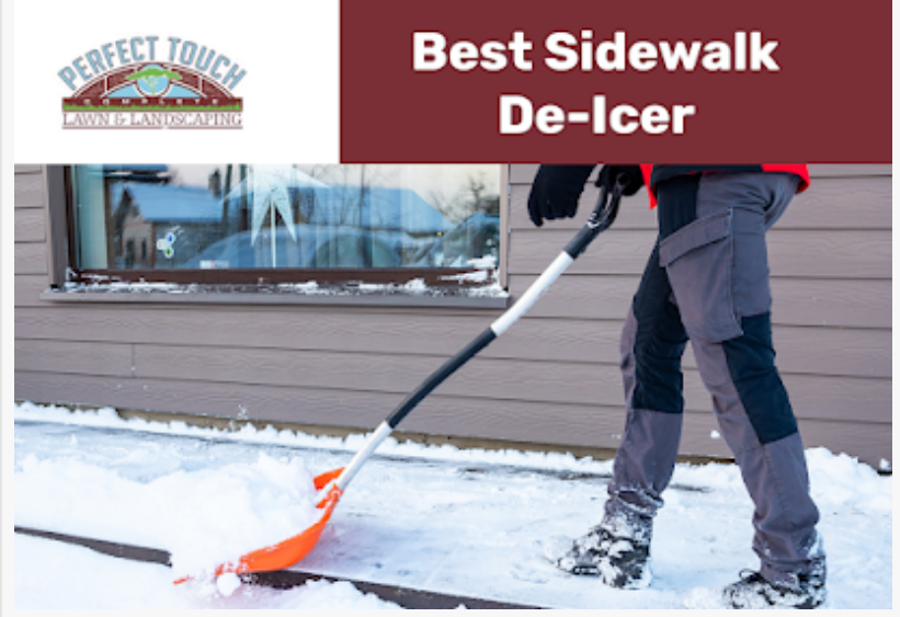
best sidewalk de-icer-