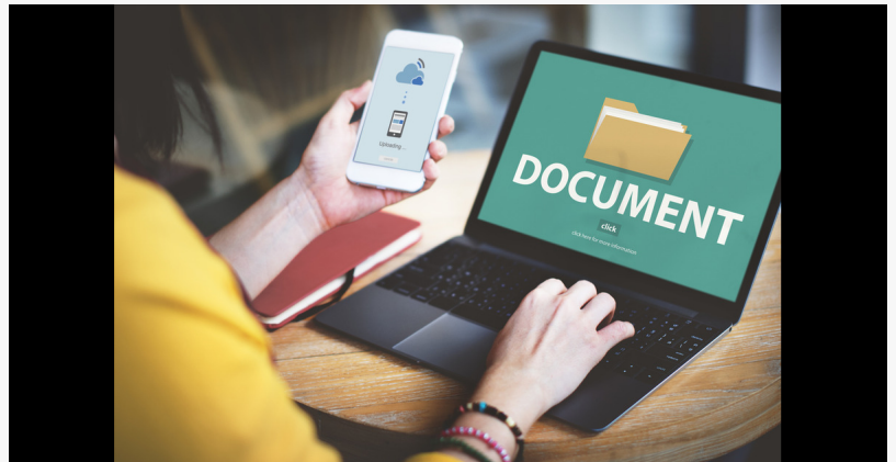
document storage -