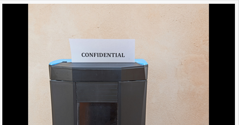
Sensitive Document Disposal Services in Los. Angeles

In addition to storing important records, businesses must also ensure the proper disposal of sensitive documents. Data security laws require organizations to destroy confidential