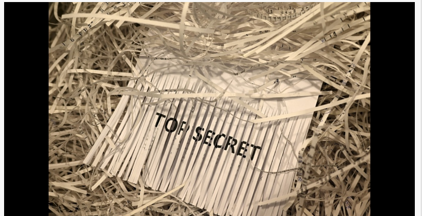
Sensitive Document Disposal -