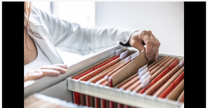
Archive Document Storage-

Archive document storage in Los Angeles is an essential service for companies seeking to preserve