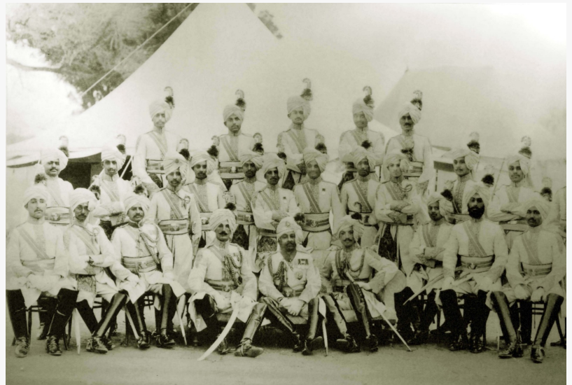
Historical Archives Preserved by the Directorate of Archaeology, Archives & Museums