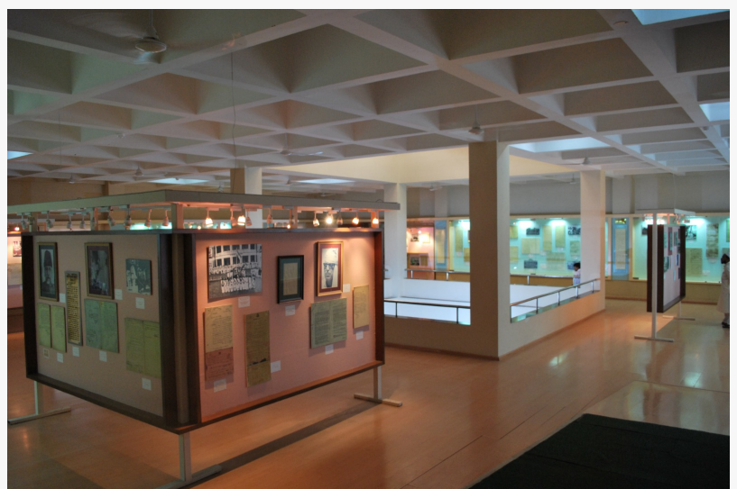
The Archives Department

Streamlining administrative processes, the new online permission portal simplifies applications