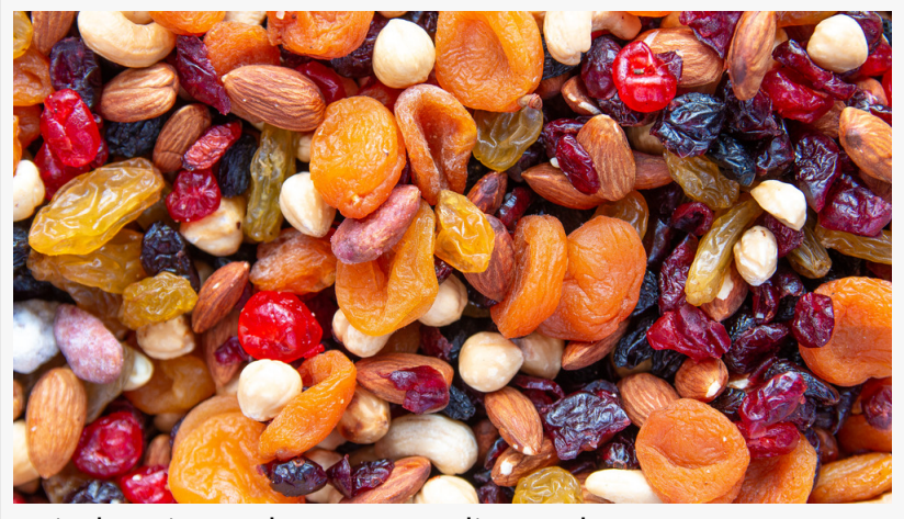
Dried Fruits and Nuts Supplier and Exporter