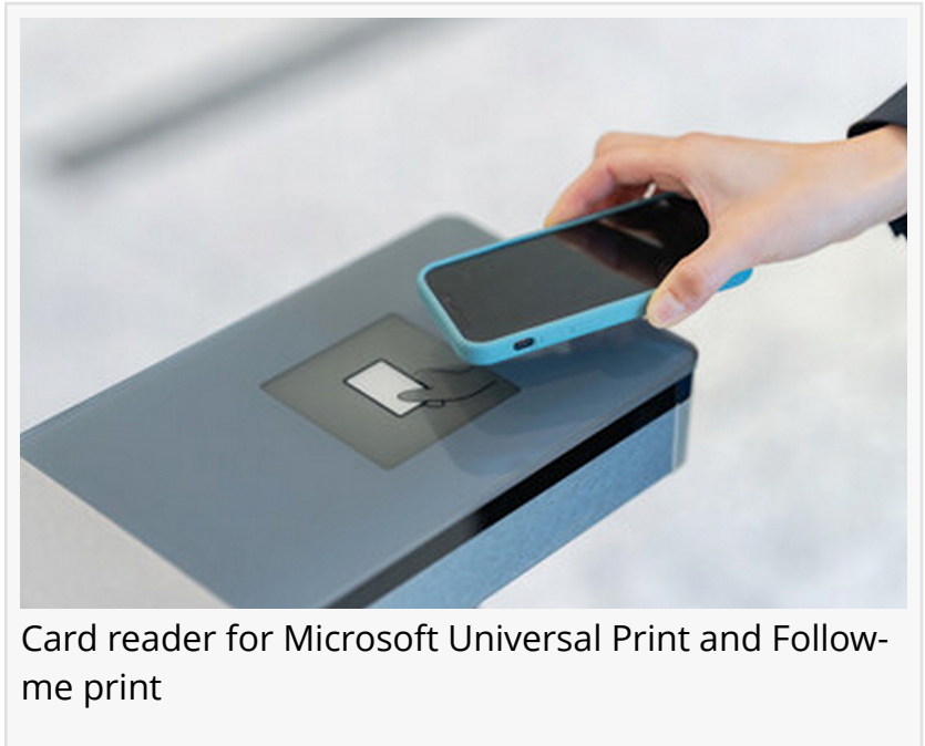
Card reader for Microsoft Universal Print and Follow-me print

MERIDIAN, ID, UNITED STATES, March 18, 2025 /EINPresswire.com/ -- Celiveo, a leader in secure enterprise printing solutions, has released a comprehensive guide titled "How to Add a Powerful Follow-Me Pull Print to Microsoft Universal Print ," now available on at https://www.celiveo.com/blog/how-to-add-a-powerful-follow-me-pull-print-to-microsoft-universal-print/ .