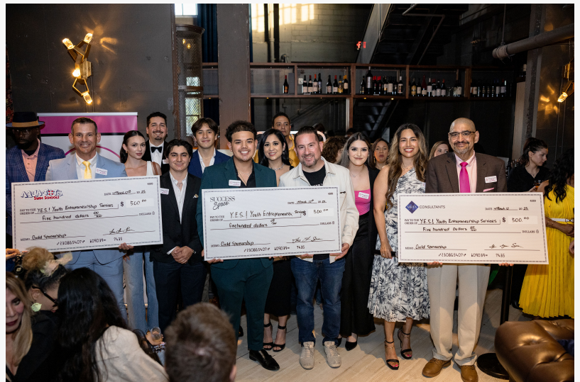
Meet our Gold Sponsors