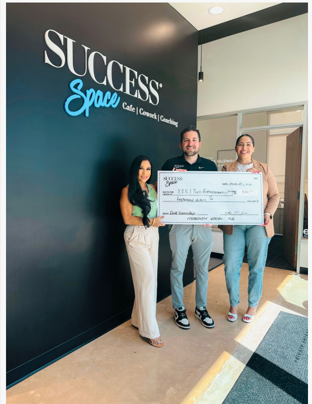
Gold Sponsor Success Space