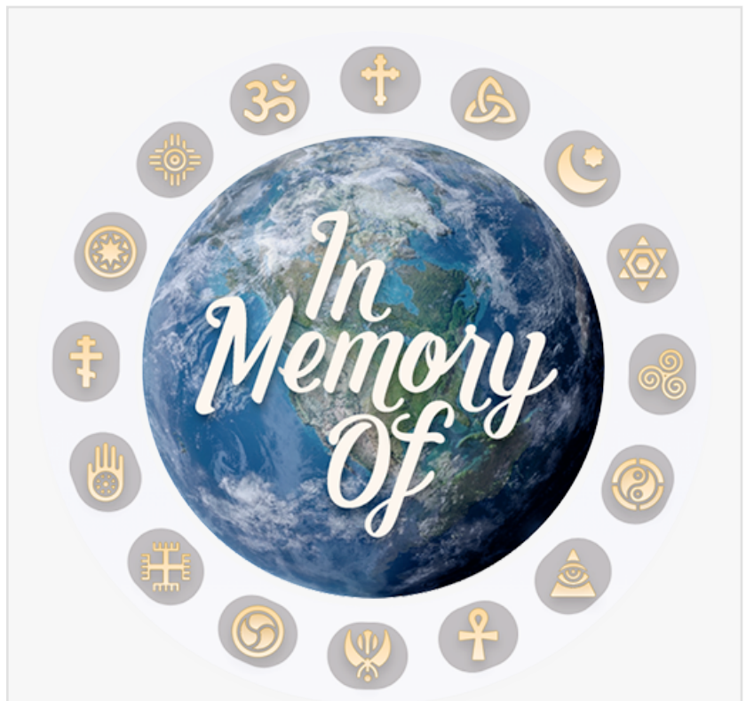
In Memory Of App

• Multilingual Accessibility: Available in multiple languages, the app accommodates diverse