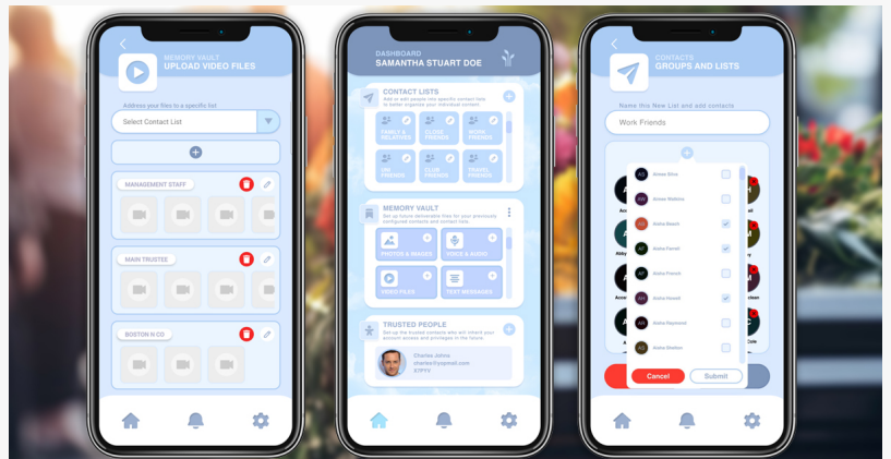
Preserve Memories & Plan Your Digital Legacy