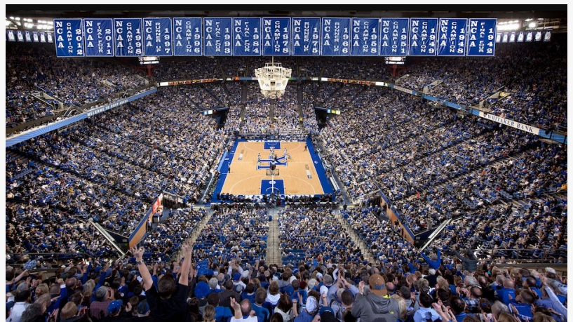
UK Rupp Arena