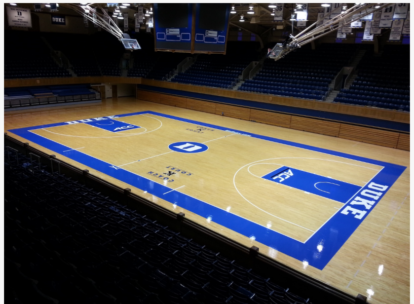
Duke Cameron Arena