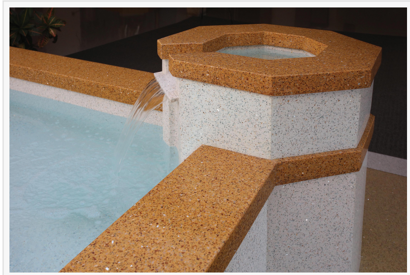
THE BAPTISMAL FONT was clad in terrazzo during the church's centennial remodel.

During construction, when terrazzo was taken into the narthex, it became apparent in comparison that other elements needed an upgrade, the architect noted. The pastor then asked to add the tile baptismal font to the