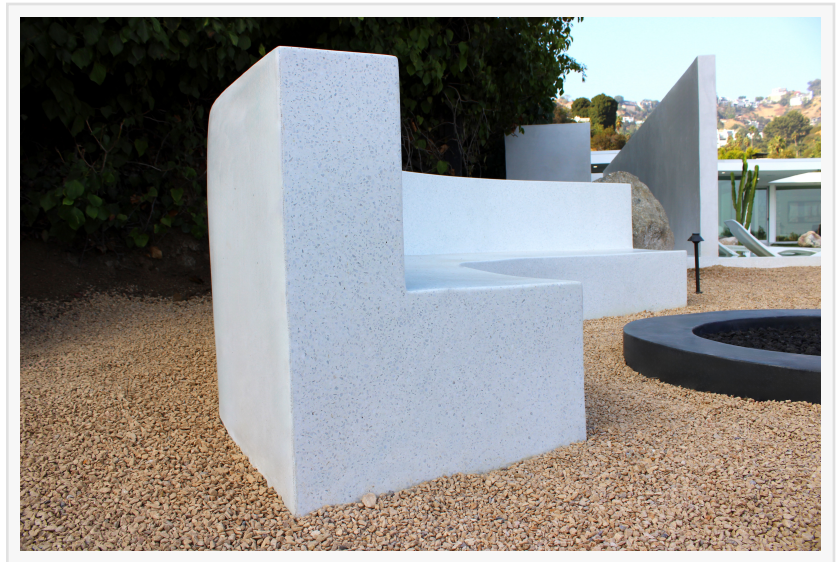
OVER THE TOP Terrazzo of El Monte, California, was presented a 2025 Honor Award by the National Terrazzo & Mosaic Association for the installation, which includes a hand-poured terrazo bench.