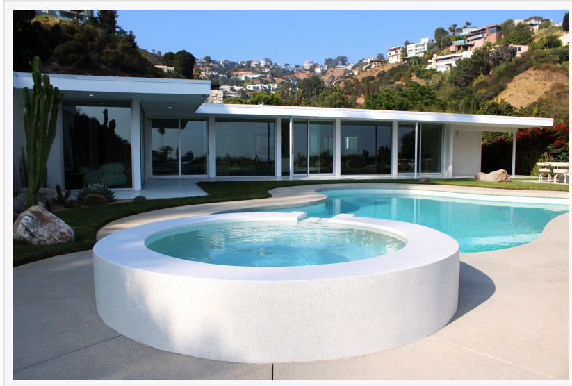
A NEW TERRAZZO patio in the winning Hollywood Hill residence includes a hot tub with a cascading waterfall.

The association's annual Honor Awards program celebrates design and construction excellence, recognizing