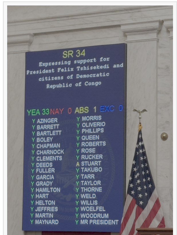
Voting Board Shows Unanimous Support for Congo Resolution Passage

This press release can be viewed online at: https://www.einpresswire.com/article/795101690