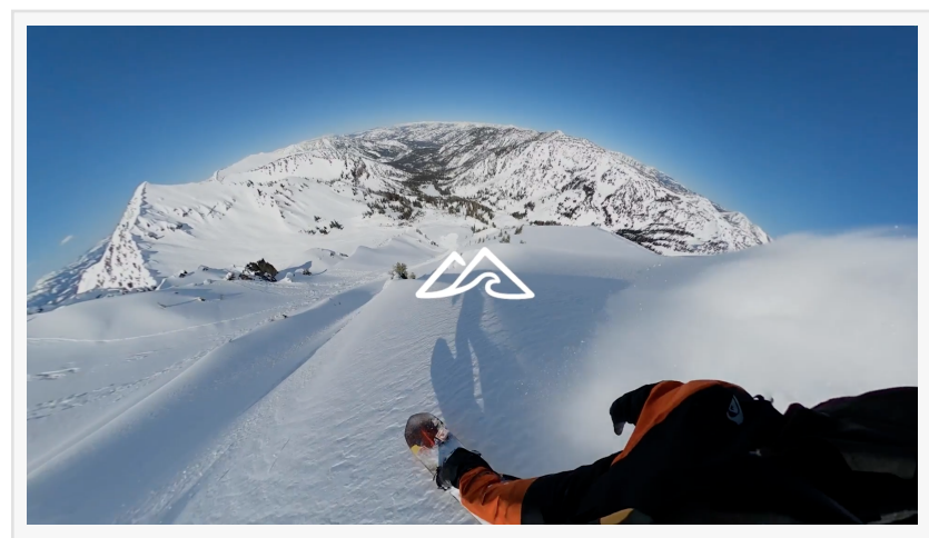
SENDY: Built by Athletes for Athletes

☐ Unlocking the Multi-Billion-Dollar Outdoor Rental Market