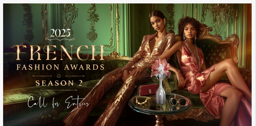
2025 French Fashion Awards S2 Calling for Entries