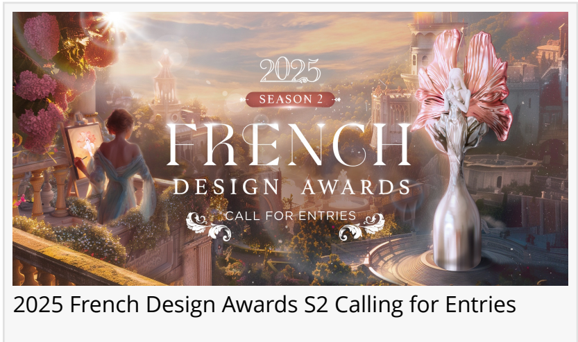
2025 French Design Awards S2 Calling for Entries

5. Conceptual Design of the Year – JJ Lin JJ20 World Tour by B'IN LIVE CO.,LTD.