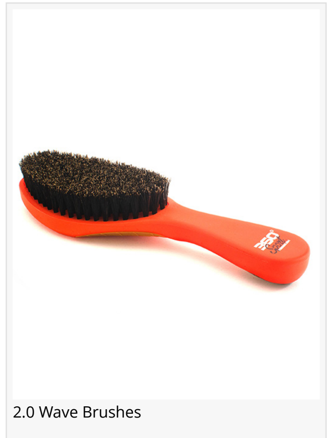
2.0 Wave Brushes