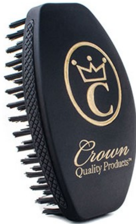
360 Wave Brushes