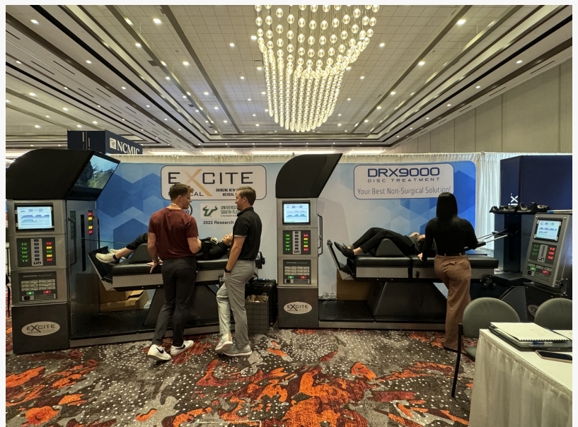
DRX9000 Lumbar Spinal Decompression Table and the DRX9000C Cervical Spinal Decompression Table at Parker Las Vegas 2025

LAS VEGAS, NV, UNITED STATES, March 19, 2025 /EINPresswire.com/ -- Excite Medical is pleased to announce its participation in Parker Seminars Las Vegas, one of the world's largest conferences for chiropractors, taking place from March 20 to March 22, The company will present its advanced DRX9000 Lumbar Spinal Decompression Table and DRX9000C Cervical Spinal Decompression Table, offering attendees the chance to experience the effectiveness of these cutting-edge technologies designed for treating various spinal conditions.