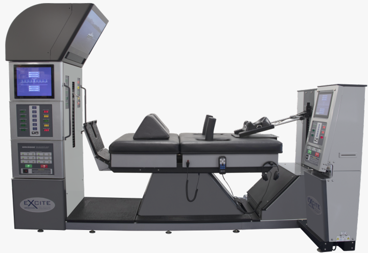
DRX9000 & DRX9000C Best Spinal Decompression Table (Lumbar Spinal Decompression & Cervical Spinal Decompression)