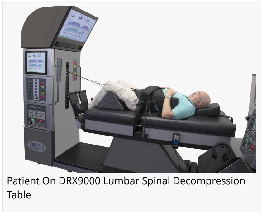
Patient On DRX9000 Lumbar Spinal Decompression Table

This press release can be viewed online at: https://www.einpresswire.com/article/795270840