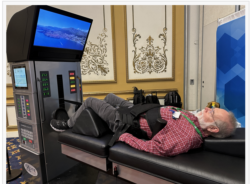
Doctor Trying DRX9000 Lumbar Spinal Decompression Table at Parker Las Vegas

Excite Medical invites all attendees at Parker Seminars Las Vegas to visit their booth to learn more about how the DRX9000 and DRX9000C can change the lives of their patients dealing with chronic pain and spinal conditions. Join us in this movement towards effective, innovative, and non-invasive spinal care solutions.