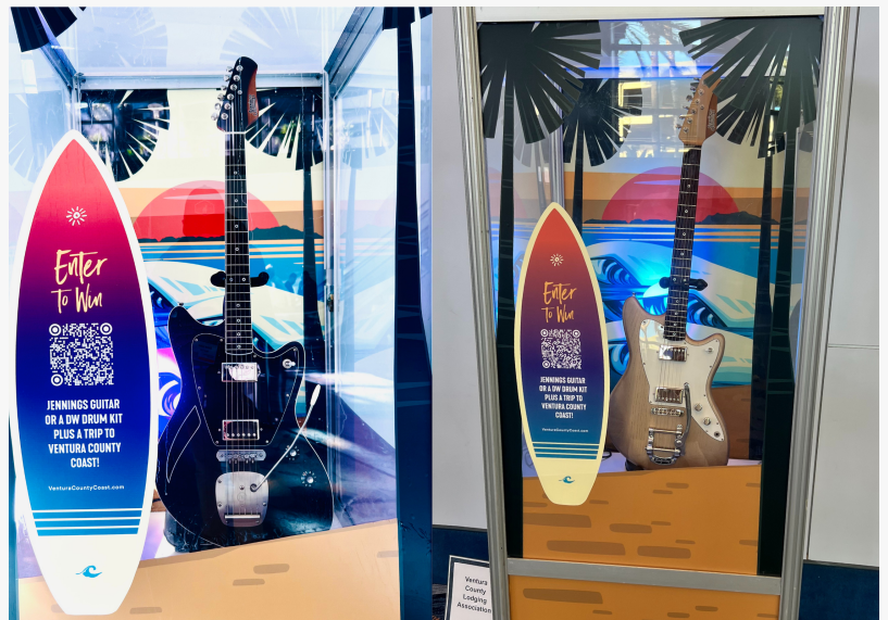
Chad Jennings' guitar displays at NAMM Showcase