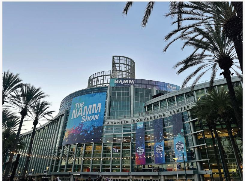
The main stage at the 2025 National Association of Music Merchants (NAMM) Convention in Anaheim, showcasing the latest in music, sound, and event technology innovation.

Partnering with local businesses and artists, Ventura County Coast designed and deployed four immersive displays at the NAMM Show, each a tribute to the region's natural beauty and creative spirit. Featuring artistically inspired imagery of Channel Islands National Park, golden sunsets, palm trees, and rolling surf, the displays came to life with vibrant lights, bold colors, and featured locally manufactured instruments—including two guitars from Jennings Guitars and two DW Drums kits. These eye-catching installations invited attendees to experience Ventura County's eclectic culture and laid-back California vibe. Adding an interactive element, each display featured a QR code, allowing attendees to enter an exclusive sweepstakes for a chance to win a