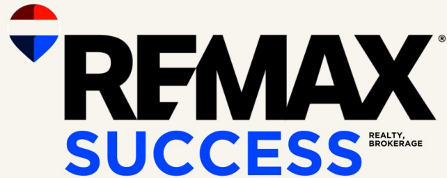
RE/MAX Success Realty Logo

"I am thrilled to join RE/MAX Success Realty at such a dynamic time in the industry. This