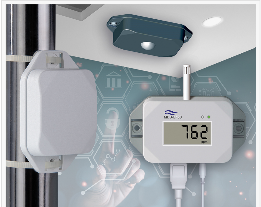
MINI-DATA-BOX enclosures are perfect for sensor and IoT/IIoT technology

MINI-DATA-BOX is now available in four plan sizes from 1.57" x 1.57" to 2.76" x 1.97" and in two