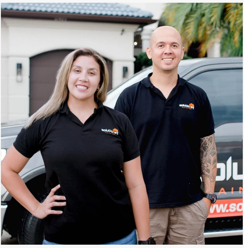
Solutions painting owners

The website redesign coincides with Solutions Painting's refined operational approach, which emphasizes a three-