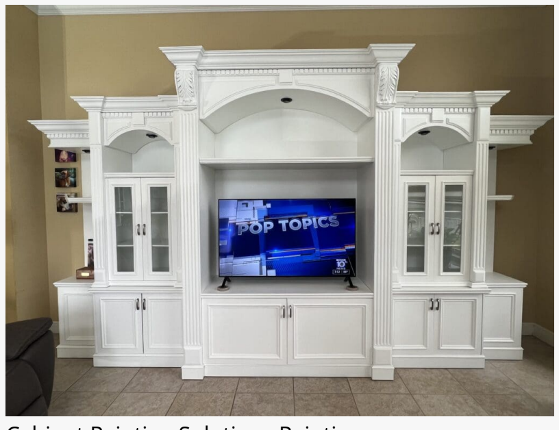
Cabinet Painting Solutions Painting

helps homeowners make informed decisions about their home improvement projects.