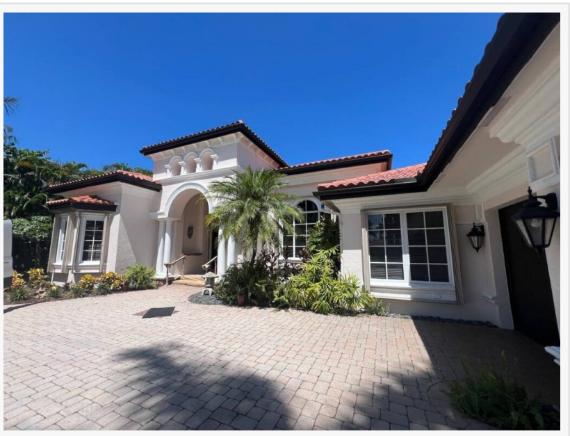
Exterior Painting Solutions Painting

The website launch also highlights Solutions Painting's commitment to transparency and customer education, featuring an extensive resource section with painting tips and ideas, maintenance guides, and detailed information about their warranty offerings. This educational content