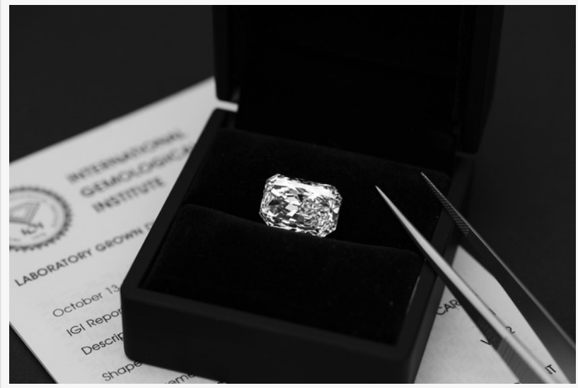
Exceptional Jewelry Craftsmanship in New York City: RobinHood Diamonds has a remarkable design, production, and management team that collaborates seamlessly to create enduring and unforgettable jewelry.

and how the diamond fits the wearer's finger are crucial factors, especially for those purchasing engagement rings. At RobinHood Diamonds, you can get a bigger lab-grown diamond for less!