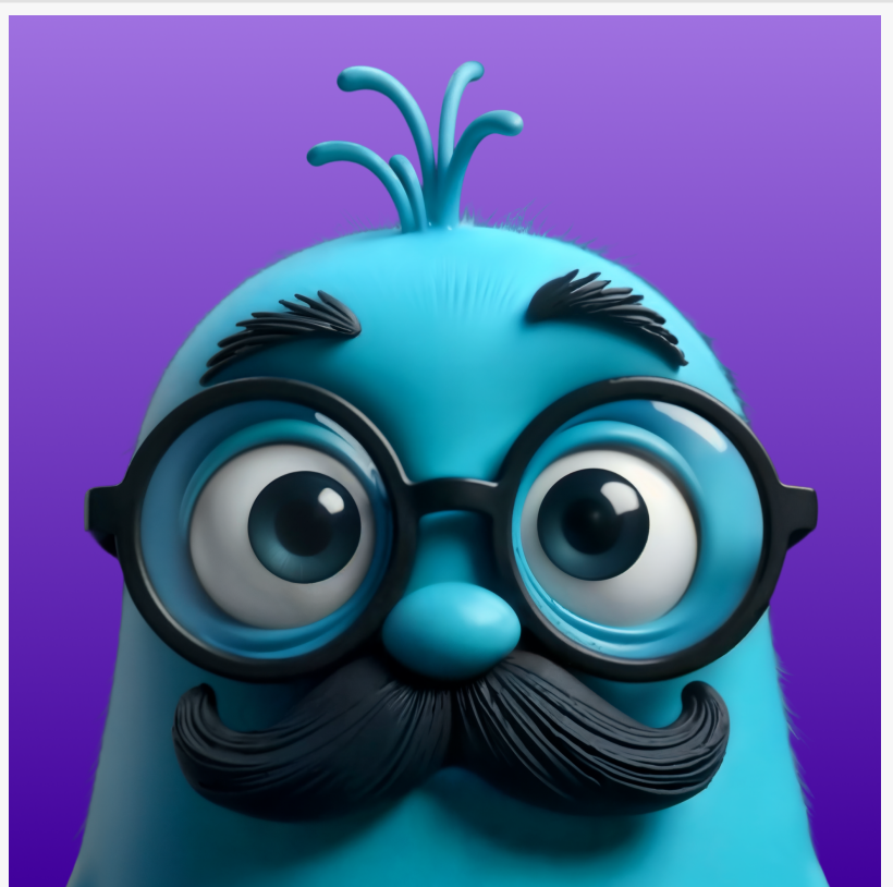
Hey Bubba AI

AUSTIN, TX, UNITED STATES, March 25, 2025 /EINPresswire.com/ -- Hey Bubba is proud to announce the official launch of Bubba AI, the industry's first-ever Voice AI Dispatcher designed exclusively for owner-operators and small fleets. Bubba AI allows trucking businesses to run their authority independently, handling everything from finding loads to back-office operations—all powered by AI. There are many Agentic solutions in the market built for Brokers or Shippers, but Hey Bubba is purpose-built only for truckers. Now you as an Owner Operator or Small Fleet have an AI solution of your own.