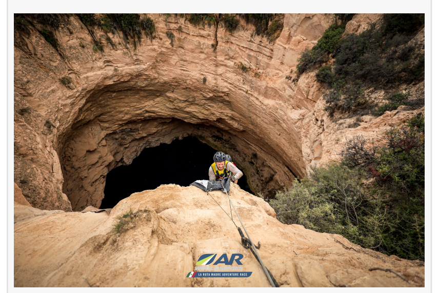
Cave descent at La Ruta Madre Adventure Race