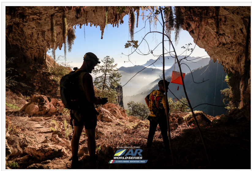
Cave checkpoint high in the mountains at La Ruta Madre Adventure Race

BENTONVILLE, AR, UNITED STATES, March 20, 2025 /EINPresswire.com/ -- La Ruta Madre Adventure Race is back for 2025 as an Adventure Racing World Series (ARWS) Qualifier, the first ever to be staged in Mexico, and promises to deliver a technically challenging course in the mountains and canyons of Monterrey, Nuevo León.