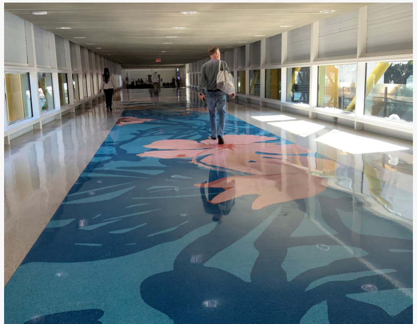
"A JOURNEY" is an artistic collaboration between the artist and terrazzo artisans.