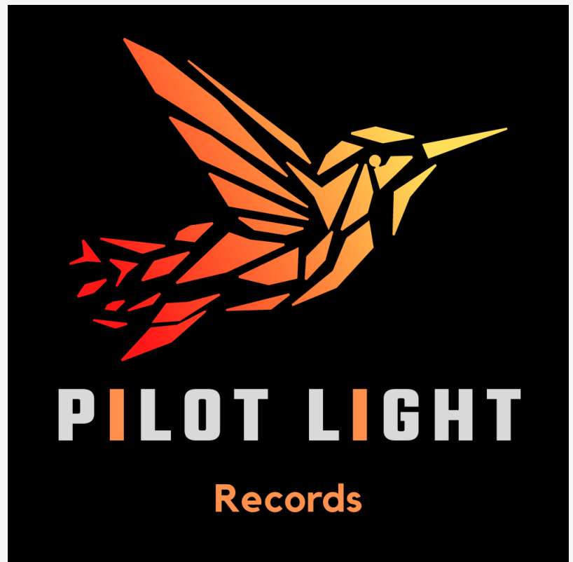
Pilot Light Records of Norwalk, CT