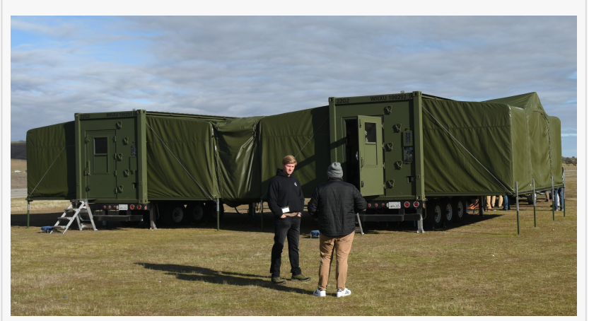
Firestorm Labs deployed xCell, a mobile expeditionary additive manufacturing station, alongside the runway at McMillan Airfield. Capable of manufacturing its Tempest drones, xCell can also produce other parts needed to maintain operational readiness.

challenging conditions their technologies will be expected to perform if part of the fleet or force.