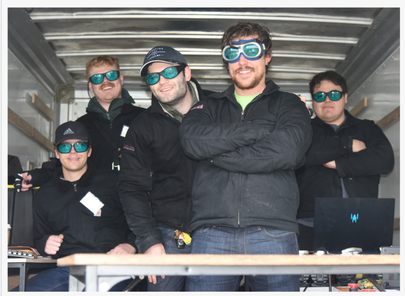
From inside a makeshift control room, the team from Aurelius—clad in their laser safety goggles—fired test shots with their laser weapon system (LWS).