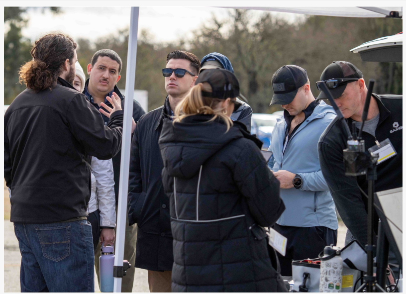
NPS students and faculty visited JIFX, including many who participate in the Bold Machina (BOMA) directed studies program. They engaged with the technologists, including learning about the coordinated drone missions flown by Gambit Defense.

-Communication and networking -Countering uncrewed systems (including by laser weapon systems) -Cyber, cyber security and electronic warfare -Expeditionary operations (including with additive manufacturing) -Infrastructure and power -Precision strike, non-lethal weapons and information operations -Situational awareness -Uncrewed aerial systems -Uncrewed systems design, deployment, operation, networking and control