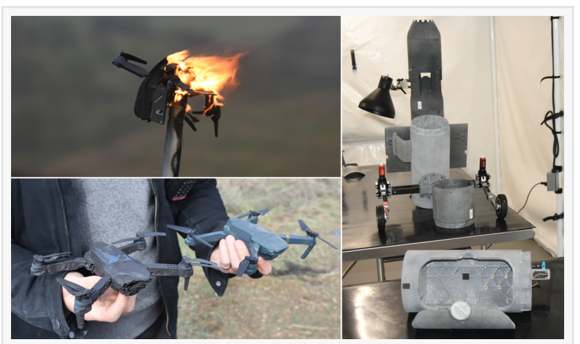
A Group 1 quadcopter burns after being engaged by Aurelius Systems' laser weapon system (LWS) during tests at the Naval Postgraduate School's (NPS) latest Joint Interagency Field Experimentation (JIFX) held Feb. 3-7, 2025.

Conducted in partnership with Camp Roberts, the California Army National Guard post in southern Monterey County, and occurring quarterly, February's weeklong JIFX featured