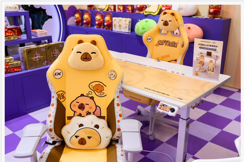
DXRACER X Capybara Gaming Chair

The Formula Series Capybara Gaming Chair is perfect for gamers who value comfort and style. It features a sleek and modern design, with adjustable armrests and a lumbar cushion for added support. The Blade Series Capybara Gaming Chair, on the other hand, is designed for gamers who prefer a more edgy and bold look. It boasts a sturdy steel frame and a high-density foam cushion for maximum comfort during