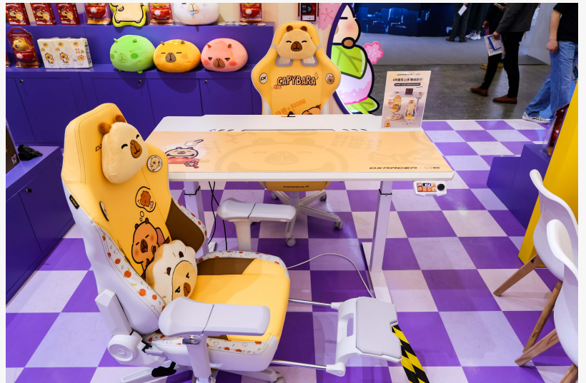
DXRACER X Capybara Gaming Chair and Desk