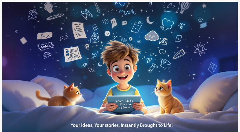
From simple prompt into fully produced video.