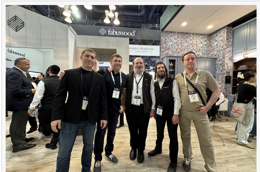
KBIS 2025 Fabuwood Booth with CabinetsHQ.com Team

PHILADELPHIA, PA, UNITED STATES, March 22, 2025 /EINPresswire.com/ -- CabinetsHQ.com, a leading provider of premium kitchen cabinetry, is proud to announce its strategic partnership with Fabuwood Cabinetry , a renowned manufacturer known for its exceptional quality and innovative designs. This collaboration aims to expand CabinetsHQ.com's product offerings, providing customers with a diverse range of high-quality cabinetry options that blend style, functionality, and affordability.