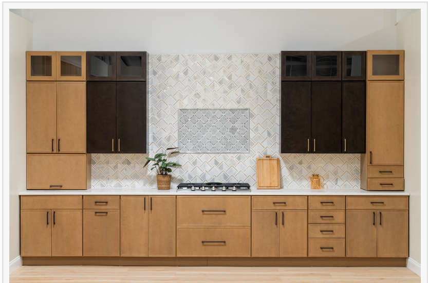
Fabuwood CabinetsHQ.com Showroom Display

Allure Luna Cabinets: Combining smooth finishes with a polished modern flair, the Luna line showcases solid wood door frames and 5-piece recessed panel drawer fronts, offering enduring appeal.