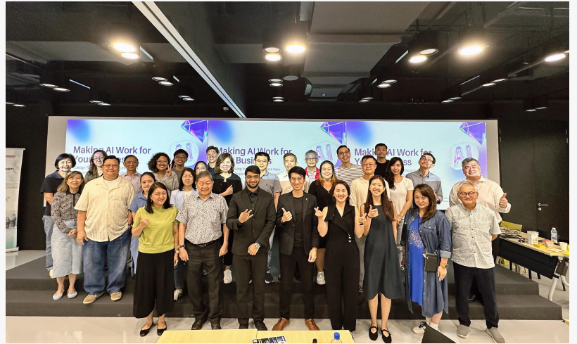
Launch of BrandsBuilder.ai at IMDA's PIXEL Innovation Hub