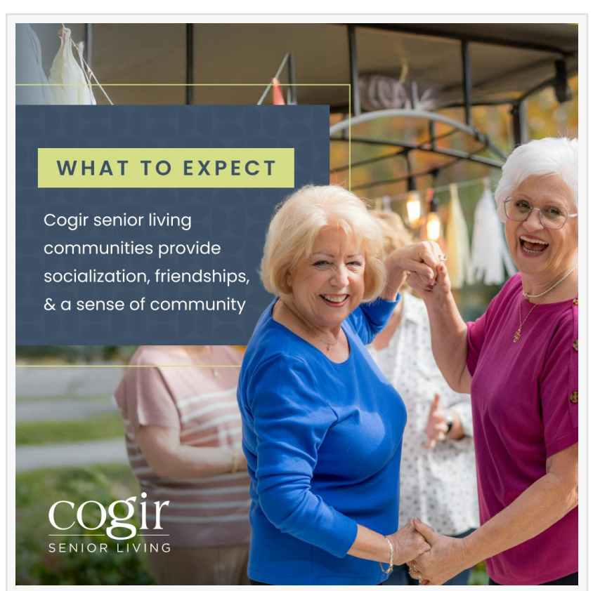
Cogir at the Narrows

TACOMA, WA, UNITED STATES, March 22, 2025 /EINPresswire.com/ -- In a significant move to enhance the quality of life for its residents, Cogir at the Narrows, a premier Tacoma assisted living facility, has announced a strategic partnership with Beyond Ride, a leading non-emergency medical transportation (NEMT) provider. This collaboration aims to offer residents seamless access to medical appointments, social engagements, and essential errands, thereby promoting greater independence and well-being.