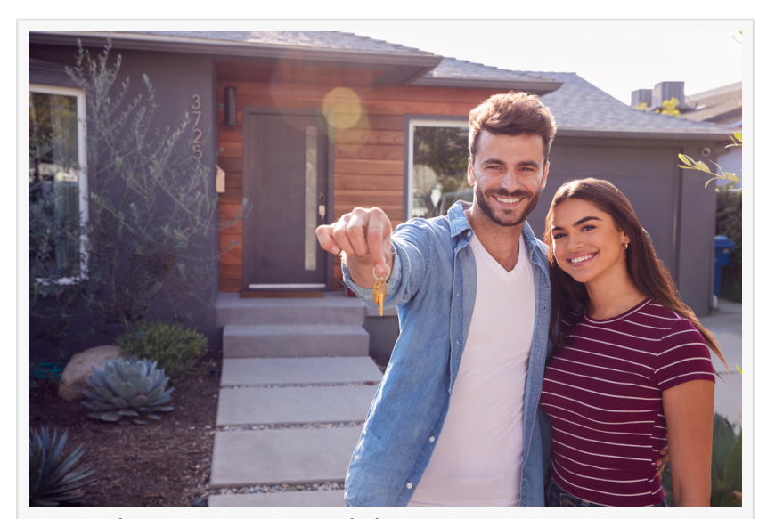
Home buying grants and down payment assistance for government employees.

TAMPA BAY, FL, UNITED STATES, March 25, 2025 /EINPresswire.com/ -- In the wake of government cost-cutting measures and job insecurity affecting public employees nationwide, Public Servant Next Door® (PSND) has reaffirmed its commitment to making homeownership more accessible for government workers. A proud part of Next Door Programs®, the nation's largest home buying program, PSND continues to offer grants up to $8,000