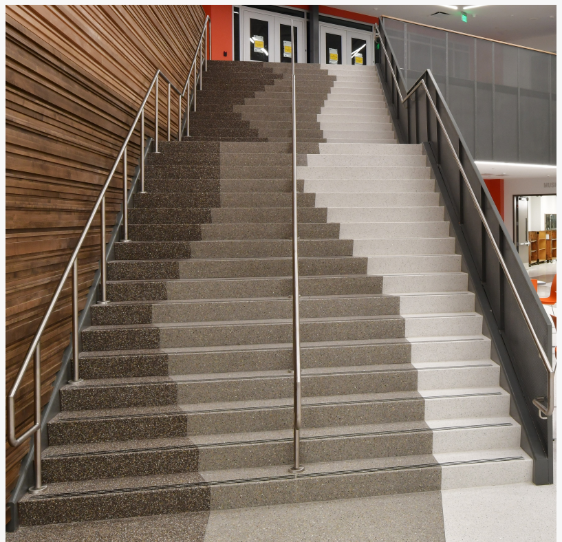
PRECAST terrazzo stairs highlight a geometric pattern that aligns precisely with the terrazzo on the upper and lower floors.