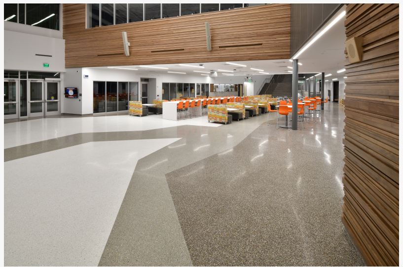
AWARD-WINNING terrazzo installed in the new Grand Junction, Colo., high school career campus unifies and complements the modern interior.

National Terrazzo & Mosaic Association is a full-service nonprofit trade association headquartered in Fredericksburg, Texas. Founded in 1923, NTMA establishes national standards for terrazzo systems and promotes terrazzo as a sustainable, durable, and versatile flooring