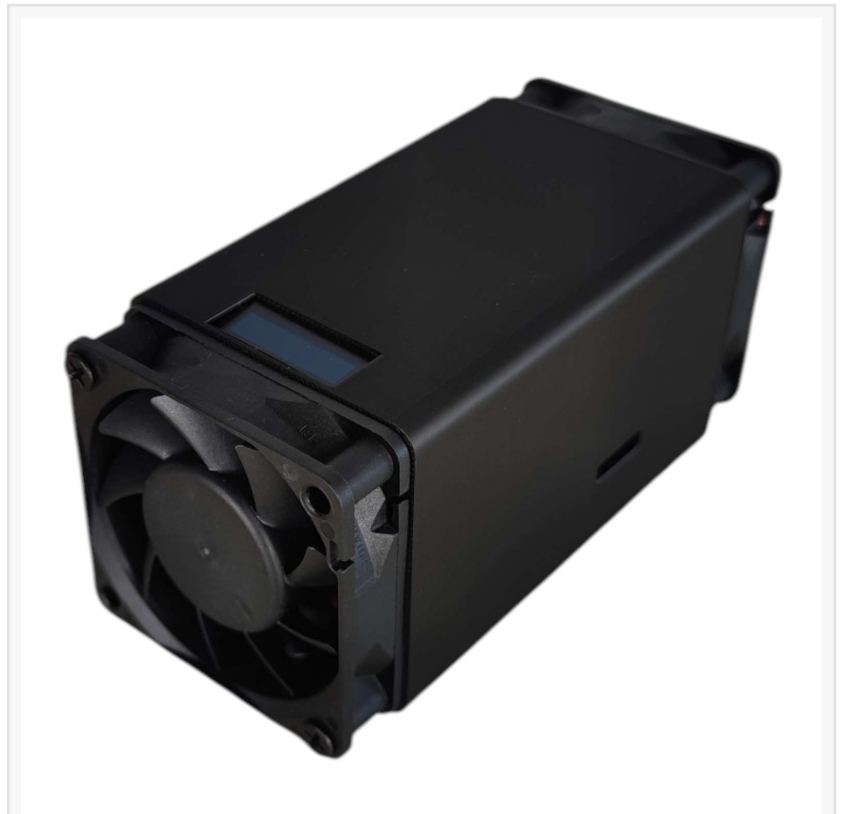
The Minibit Gamma: OC Edition powered by Bitaxe Gamma

The block, mined at 20:30:28 UTC on March 22, 2025, included 0.027 BTC in transaction fees and delivered a full 3.152 BTC block reward, cementing itself in the blockchain with the coinbase tag "Public Pool on Umbrel." With a size of 1.79 MB and weight of 3.97 million weight units, this block was processed by an individual miner operating independently through a self-hosted Bitcoin node and solo mining pool on Umbrel, and powered by the efficient and accessible Bitaxe miner—a small form-