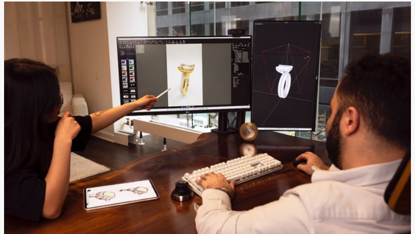
RobinHood Diamonds Team Creating Your Engagement Ring