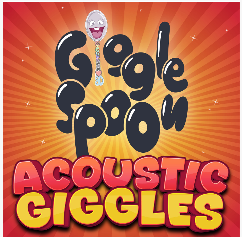
Acoustic Giggles by Giggle Spoon out 4/4/25 (pre-order now)