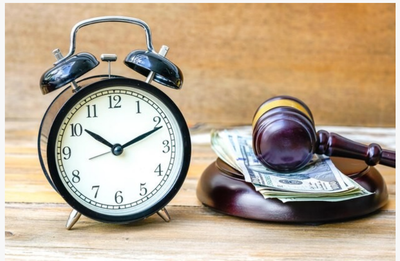
professional bail bond