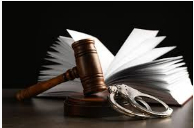
Chuck Brown II Bail Bond