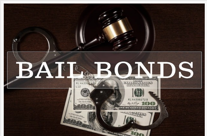
bail bond agency 1

The introduction of 24/7 services by Chuck Brown II Bail Bonds reflects an industry shift toward greater accessibility. This initiative ensures individuals have continuous access to professional bail bondsmen, offering immediate guidance and reducing the stress associated with extended