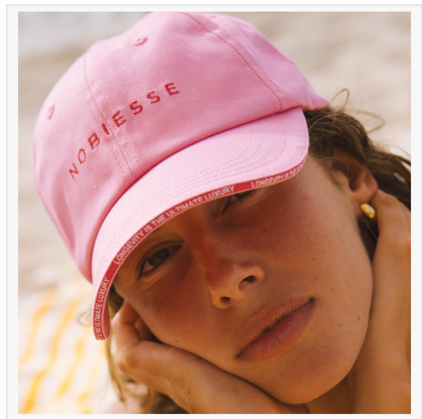
Nobiesse - Longevity is the Ultimate Luxury

Essential Oils: Naturally derived scents that offer a calming aromatherapy experience without synthetic fragrances.