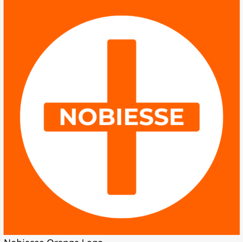
Nobiesse Orange Logo

Botanical Extracts: Infuse the soaps with antioxidants that help protect the skin from environmental stressors.