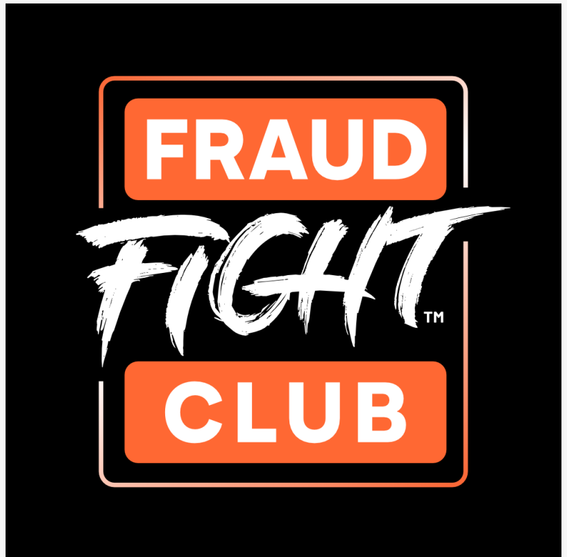
Fraud Fight Club's Logo