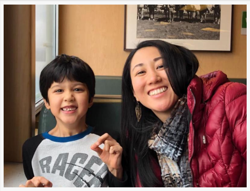
Practice love and acceptance