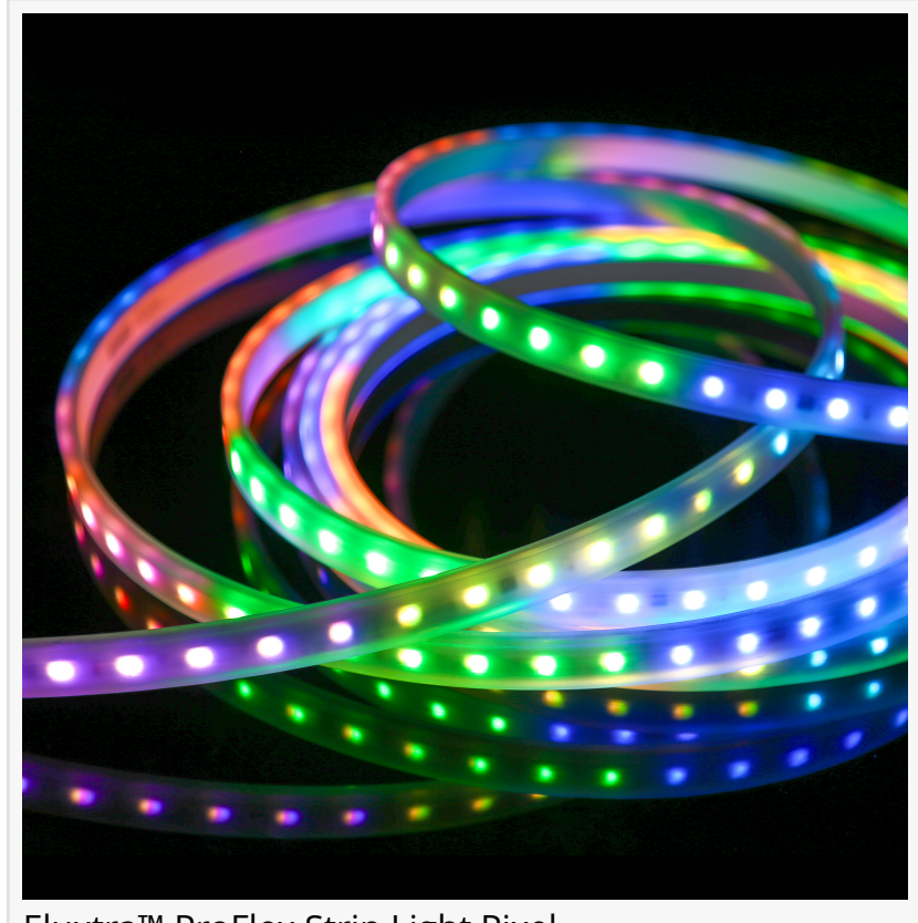
Eluxtra™ ProFlex Strip Light Pixel

SAN DIEGO, CA, UNITED STATES, March 25, 2025 /EINPresswire.com/ --Environmental Lights, a leading innovator in LED lighting solutions, and City Theatrical, a global expert in entertainment lighting technology, are proud to introduce the <u>Eluxtra™</u> <u>ProFlex line</u> of premium LED linear lighting products. Developed with City Theatrical, the Eluxtra™ ProFlex line is characterized by exceptional craftsmanship and extreme durability, making these products ideal for indoor and outdoor installations.