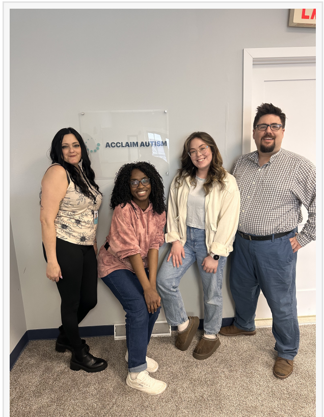
Brewerytown Location Oregon Pike Staff by Acclaim Autism Sign

professionals, Acclaim Autism is dedicated to delivering evidence-based interventions that promote positive outcomes and enhance the quality of life for individuals and their families. Building on the success of its programs in other Pennsylvania locations, Acclaim Autism is committed to expanding access to quality ABA therapy.