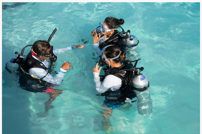
Diving at Nova

Taking place at Nova's stunning South Ari Atoll location, this event will feature guided dives, marine conservation workshops, and sustainability-focused training. Guests will have the rare opportunity to explore the protected pristine waters of the South Ari Marine Protected Area (SAMPA), witness diverse marine life, including manta rays and whale sharks, and deepen their understanding of ethical diving and ocean stewardship.