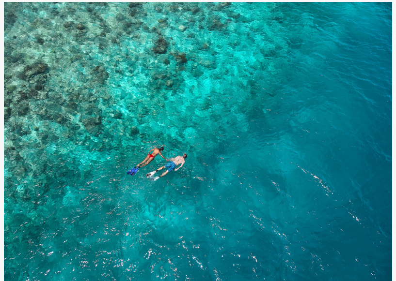
Snorkelling at Nova