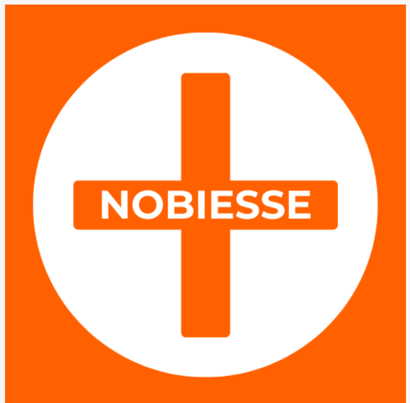
Nobiesse Orange Logo