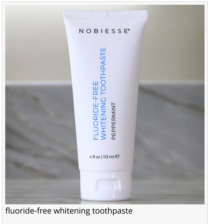
fluoride-free whitening toothpaste

For decades, fluoride has been a standard ingredient in toothpaste, but recent discussions about overexposure and its potential effects have led many to seek alternatives. While fluoride can help prevent cavities, studies suggest excessive intake may contribute to dental fluorosis, thyroid dysfunction, and other concerns. As a result, fluoride-free formulations have gained traction among health-conscious individuals.