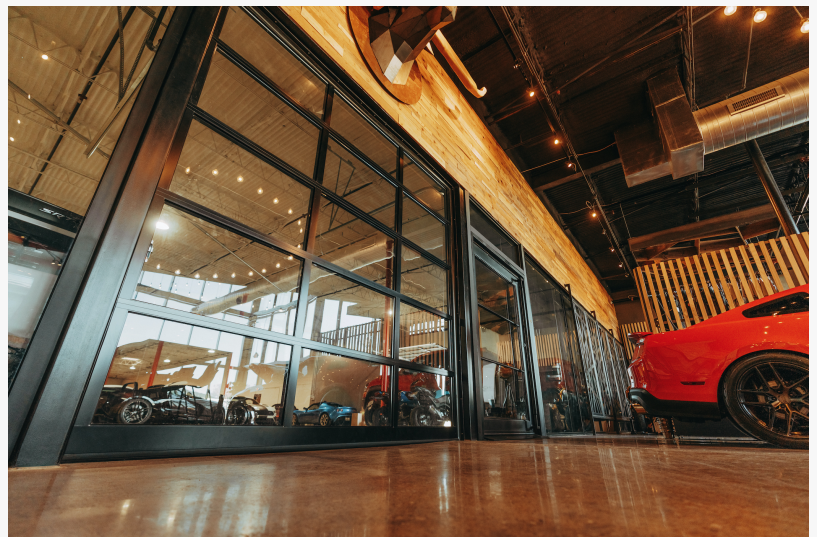
Texas Hot Rides showroom features Aluminum floor to ceiling windows, a garage door, a steel pivot door, and custom laser cut steel partitions from Love That Door..