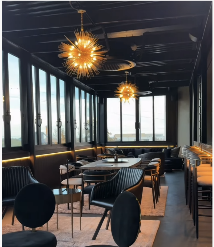
Aluminum Bifold Windows enclosing Calabrese's rooftop Sopra Lounge