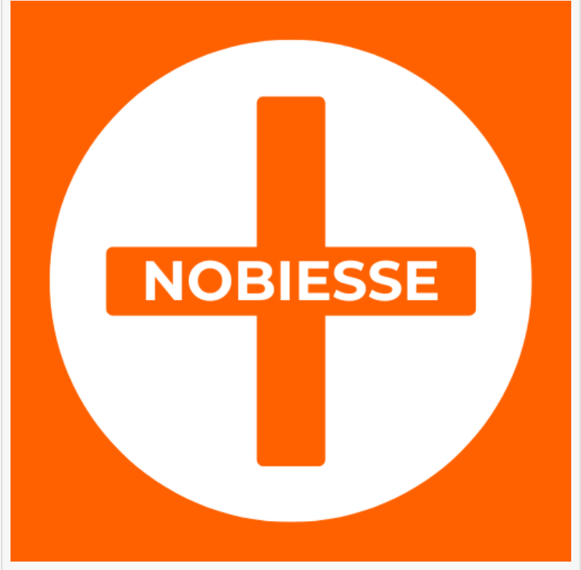
Nobiesse Orange Logo

skincare routine can help address common concerns such as dryness, redness, acne, and premature aging.