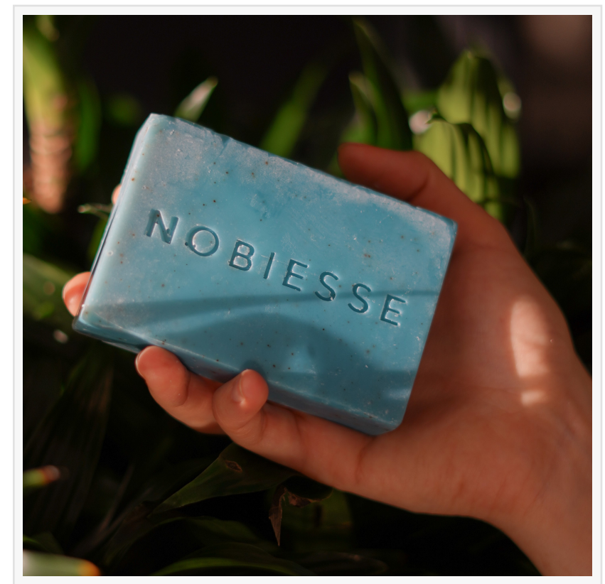
Nobiesse Methylene Blue Bar Soap Exclusive Anti-Oxidant Bath Shower

The Men's Morning Routine Kit with Methylene Blue includes four essential products that work synergistically to cleanse, hydrate, and protect the skin throughout the day: