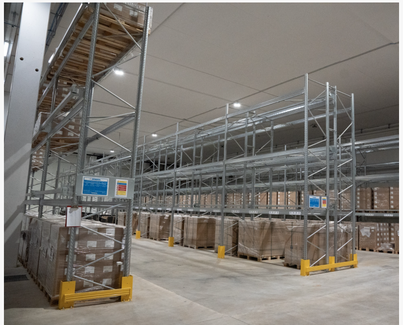
Singota Solutions Balerna Facility Warehouse

BLOOMINGTON, IN, UNITED STATES, March 25, 2025 /EINPresswire.com/ -- Singota Solutions , a trusted partner for pharmaceutical development and cGMP sterile drug product manufacturing as well as supply chain services, announces the opening of its new facility in Balerna, Switzerland. This expansion bolsters Singota's global presence and demonstrates a commitment to delivering advanced, GMP/GDP compliant storage and logistics solutions tailored to the pharmaceutical industry globally.