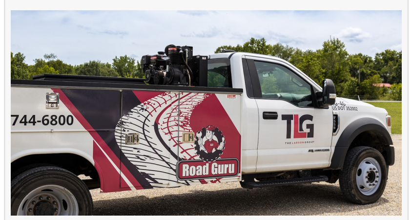
TRP NE Arkansas offers semi-truck mobile service repair with two Road Guru mobile service trucks.

This press release can be viewed online at: https://www.einpresswire.com/article/796983967